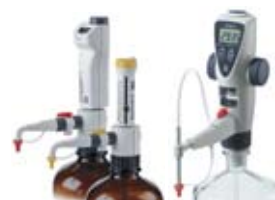
Bottletop Dispensers & Burettes

BrandTech Scientific — Your ACE in the RAT RACE!