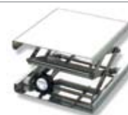
Stainless Support Jacks