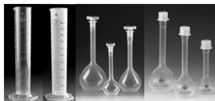
Class A & B Graduated Cylinders and Class A & B Volumetric Flasks with stoppers or screw caps

Details at www.brandtech.com or call for a catalog of our line of PFA, Volumetric & General Laboratory plastic products, including bottles, beakers, sample vials, funnels and scoops.