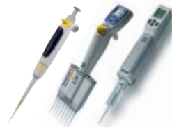
Manual, Electronic & Repeating Pipettes