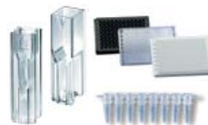
Life Science Plastics