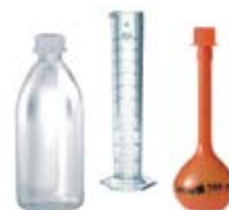
Volumetric & General Lab Plastics