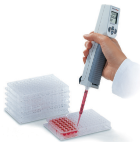
HandyStep ® electronic Repeating Pipette

The HandyStep ® electronic features three operational modes: Pipette, Dispense, and an Auto-Dispense mode in which the pipette "learns" the user's dispensing rhythm, and maintains it as long as the control button is pressed reducing repetitive motion by up to 97%. No time-interval programming is needed! All aspects of operation are shown clearly on the large LCD screen with symbols, words, and values. The screen is easy to read during right- or left-handed operation.