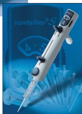
HandyStep ®S repeating pipette

For those looking for a mechanical repeating pipette, consider the economical HandyStep ®S . Accepts the same tips as the HandyStep ® electronic.