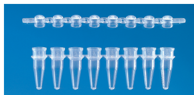
BRAND PCR tube strips