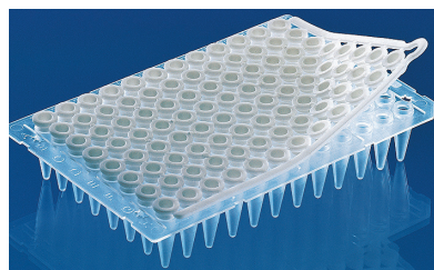
96-well PCR plate, unskirted with TPE mat