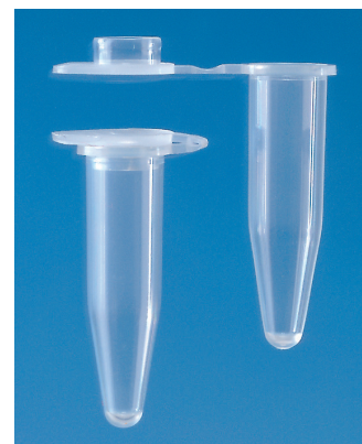
BRAND PCR tubes