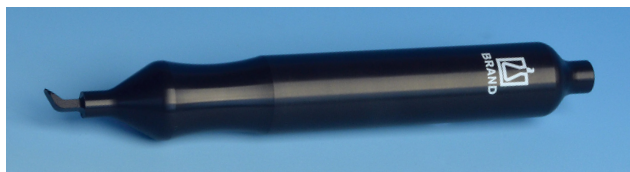
NEW! Cap Tool

White PCR products are designed specifically to optimize results when performing quantitative Real Time PCR (qPCR). White PCR strips and plates offer significantly better results in the analysis of fluorescence signals and consequently with the quantification of the replicated DNA.