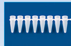
White PCR strips optimized for qPCR