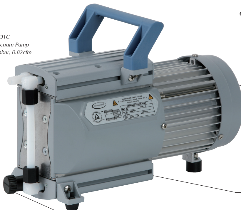
MD1C Vacuum Pump 2mbar, 0.82cfm

Totally dry, there's no oil to change or monitor! Typical diaphragm lifetimes are in excess of 15,000 hours of use—that's years in most applications, so there is very little downtime and low service costs. When it is finally time for service, precision diaphragms eliminate tedious, trial-and-error stroke length recalibration.