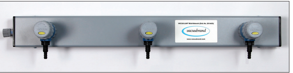
Each VACUU • LAN® Mini-Network includes three manual flow control valves.